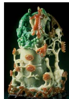
A jadeite ewer, created in the early 20th century.