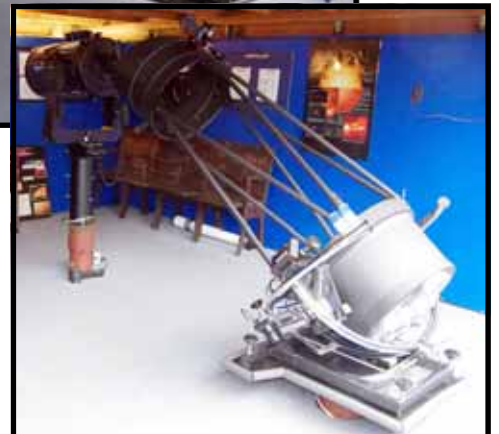
Comba/Windolf 18" Dobsonian telescope